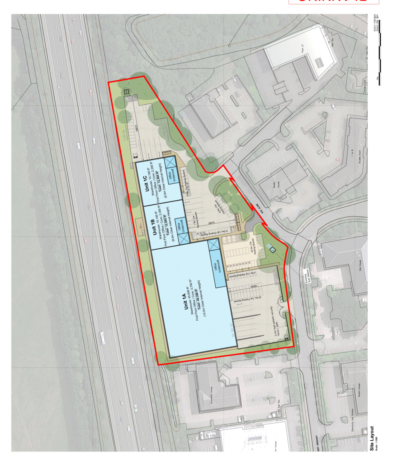
Approved Site Plan